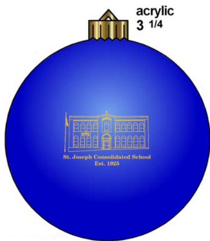
Front (school ornament) Note: back is blank