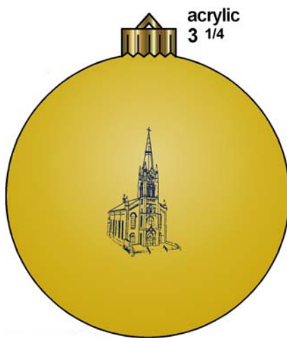
Front (church ornament)